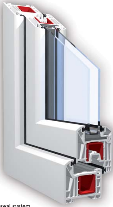
Five chamber double seal system with 70 mm installation depth

Windows from the KBE System_70mm have all been designed according to the state of the art. They are ahead in the most important criteria that fastidious developers demand today from windows.