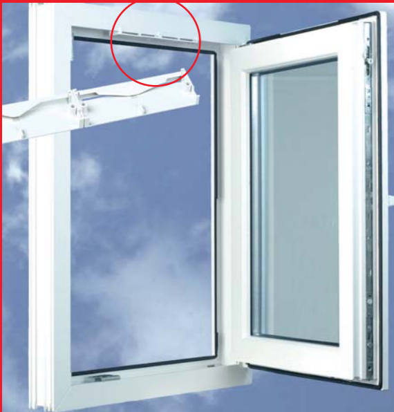
REGEL-air® with WV