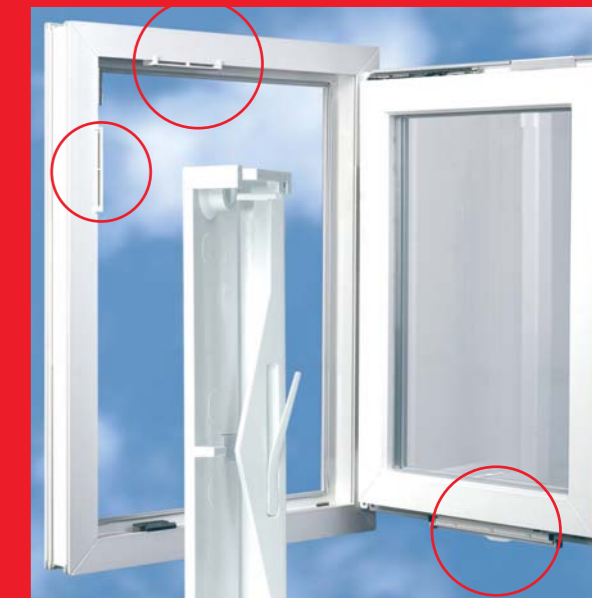
REGEL-air® PLUS with WV + FR

The pleasures of ventilation – for a healthier home thanks to REGEL-air®